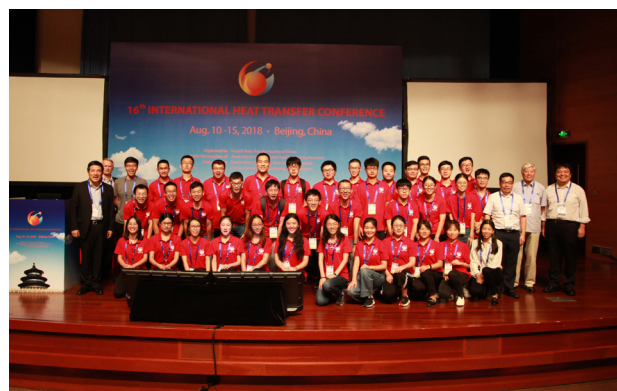
Fig. 9. IHTC–16 student volunteers

The conference organizing committee extends special appreciation to all the student volunteers (Fig. 9), who put in many hours preparing for the conference, facilitating the excellent registration process, organizing all the meeting rooms and facilities, and very ably assisting many delegates during the conference.