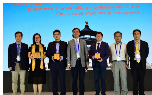
Fig. 2. Young Scientist Awards presented at the banquet