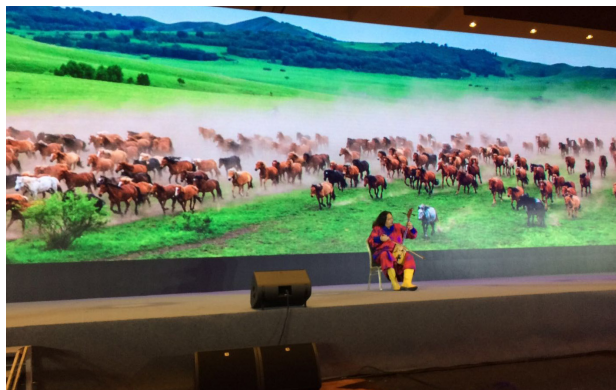
Fig. 8. Mongolian Erhu performance during the conference banquet

The IHTC–16 closing session was followed by a wonderful banquet with five outstanding performances: 1. Clarinet quintet played by students from the Tsinghua Symphony Orchestra; 2. Water Drumming; 3. Mongolian Erhu recital (Fig. 8); 4. Magical Sichuan Opera face-changing demonstration, and 5. an amazing acrobatics demonstration.