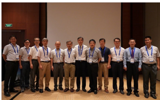
Fig. 1. Executive Board meeting during IHTC-16

In addition, other international conferences and seminars in specific topics have been sponsored by the Union. Past, present, and future activities are discussed on the Union's website at http://www.autse.org .