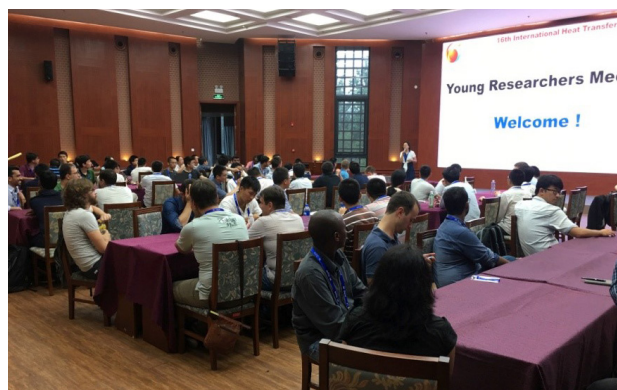
Fig. 7. Opening session of the Young Researchers Meeting

IHTC–16 also included a Young Researchers Meeting designed to encourage casual interchanges of research and ideas in thermal science and engineering and to expand the international networks among young researchers from all over the world. Figure 7 shows the large number of participants at the opening session. The meeting included a visit to the Summer Palace and Tsinghua University, stimulating networking activities, and a dinner party with more than 50 participants.