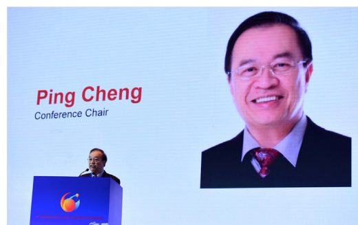
Fig. 2. Prof. Ping Cheng's lecture in the Opening Ceremony

More than 1800 abstracts were initially submitted to the conference and were reviewed by the members of the Assembly of International Heat Transfer Conferences (AIHTC). The full-length manuscripts were then reviewed by peer reviewers assigned by the members of AIHTC. The statistics for the abstract submissions and acceptances and the paper submissions and acceptances are shown in Fig. 3 for the various regions. The final manuscripts accepted by the reviewers are all now included in the Begell House International Heat Transfer Conference Digital Library. The conference included sessions devoted to Boiling and Evaporation, Nano and Microscale Transport, Computational Methods and Simulation, Heat Transfer Enhancement, Conduction and Inverse Problems, Convection, Condensation, Thermophysical Properties Measurement, New Energy and Efficiency, Electrochemical Systems, Multiphase Flow, Bio and Medical Applications, Manufacturing/Magnetohydrodynamic (MHD) and Plasma, Heat Exchangers, Energy Conversion and Storage, Porous Media, Cooling and Thermal Management, Radiation and Thermal Insulation, Mass Transfer, Combustion and Thermochemistry, Molecular, Photon, Phonon and Electron Transport, and Refrigeration and Cryogenics.