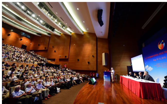
Fig. 6. Participants and panelists at the panel discussion on Entransy: a New Concept in Heat Transfer

Figure 6 shows the large number of attendees at the Entransy panel discussion that included excellent introductions from the panelists and then a lively discussion of the Entransy concept with the attendees. IHTC-16 also included 28 exciting and informative keynote lectures that are listed in Table 1.