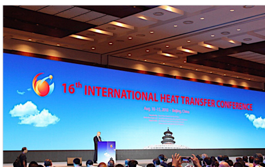
Fig. 1. IHTC-16 Opening Ceremony

The 16 th International Heat Transfer Conference (IHTC–16) was held in Beijing, China, on August 10–15, 2018. IHTC–16 was a very successful conference with 3 plenary lectures, 28 keynote lectures, 4 panel sessions, 40 general sessions, more than 1000 papers from more than 40 countries and regions, and more than 1400 participants. This was the largest IHTC meeting ever held. The conference took place in the China National Conference Center, which is in the center of the Olympic Park in Beijing. The opening ceremony (Fig. 1) was held in the main auditorium with over 1000 participants in attendance. Professor Ping Cheng, chairman of IHTC–16, gave a lecture in the opening ceremony (Fig. 2).